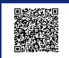
Payment QR Code